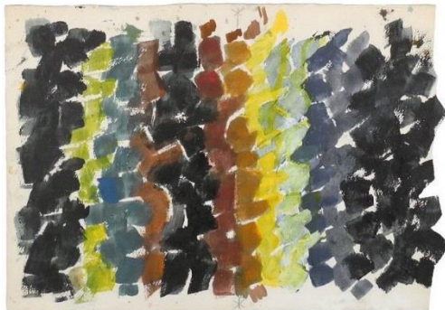
Alma Thomas, Untitled , 1968, Acrylic on paper, 12 x 17 inches, Collection of Jacqueline Bradley and Clarence Otis

Winter Park, FL (January 25, 2015) - During the twentieth century, American women artists experimented with abstraction. Perhaps the most well-known American woman painter is Georgia O'Keeffe, who is represented in the permanent collection of the Cornell Fine Arts Museum. O'Keeffe's abstract tendencies resulted in dynamic representations of the physical landscape and flowers. Another often cited story of women artists engaged in abstraction comes later in the twentieth century when painters such as Lee Krasner and Helen Frankenthaler engaged with large scale abstraction informed by abstract expressionism and color field painting. This exhibition looks not only at twentieth-century examples, but also demonstrates the role of abstraction in contemporary art. In fact, the relationship between women artists and abstraction was a major theme to emerge from the 2014 Whitney Biennial. Although by no means exhaustive, this exhibition seeks to examine the legacy of women artists and abstraction and to understand a fuller, more dynamic story of modern and contemporary art. "The exhibition highlights works from our collection yet casts a wider net, weaving a larger narrative made possible by several important loans. In keeping with our teaching mission, it hopes to make us rethink some prevailing notions in the story of American abstraction," said Ena Heller, Ph.D., the Bruce A. Beal Director of the Cornell Fine Arts Museum.